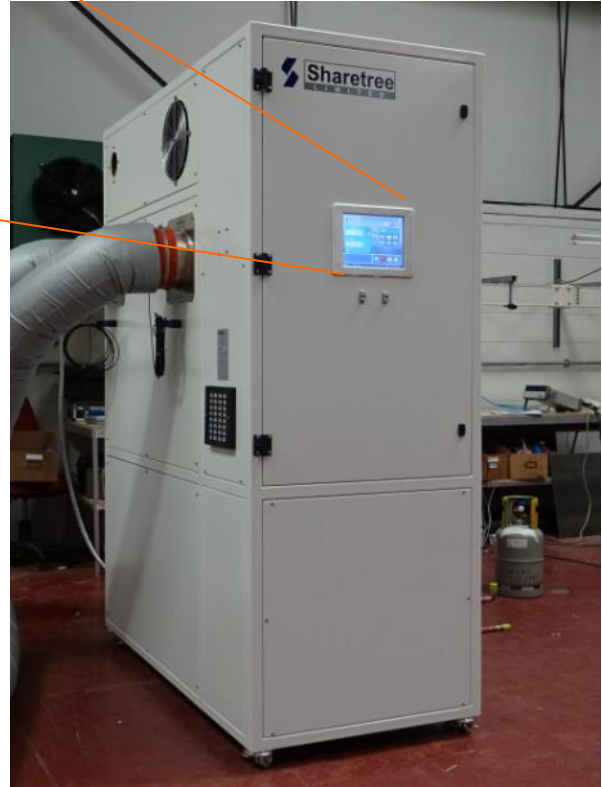
Typhoon ACU (fitted with SIMPLEtouch programmer )